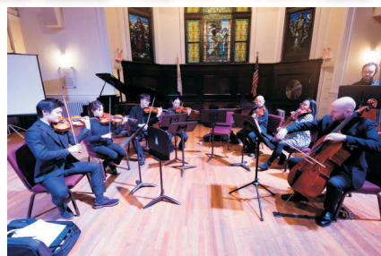
Circle Wind Chamber Ensemble