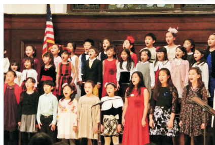
Circle Wind Boys & Girls Choir