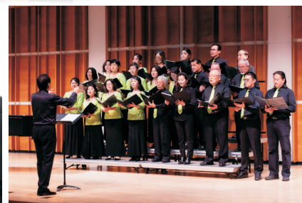
Japan Choral Harmony "TOMO"

November 5, 2023 (Sun) at 4:30 p.m. | Doors open at 4:00 p.m.